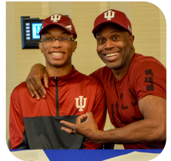
Photos from CLD Scholarship signing with scholars and their families and group photo of our 2019 CLD Scholars