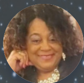
Evelyn Pierce-Hicks National Sorority of Phi Delta Kappa Inc.