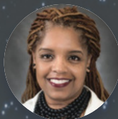
Jill English Child Advocates (CASA)