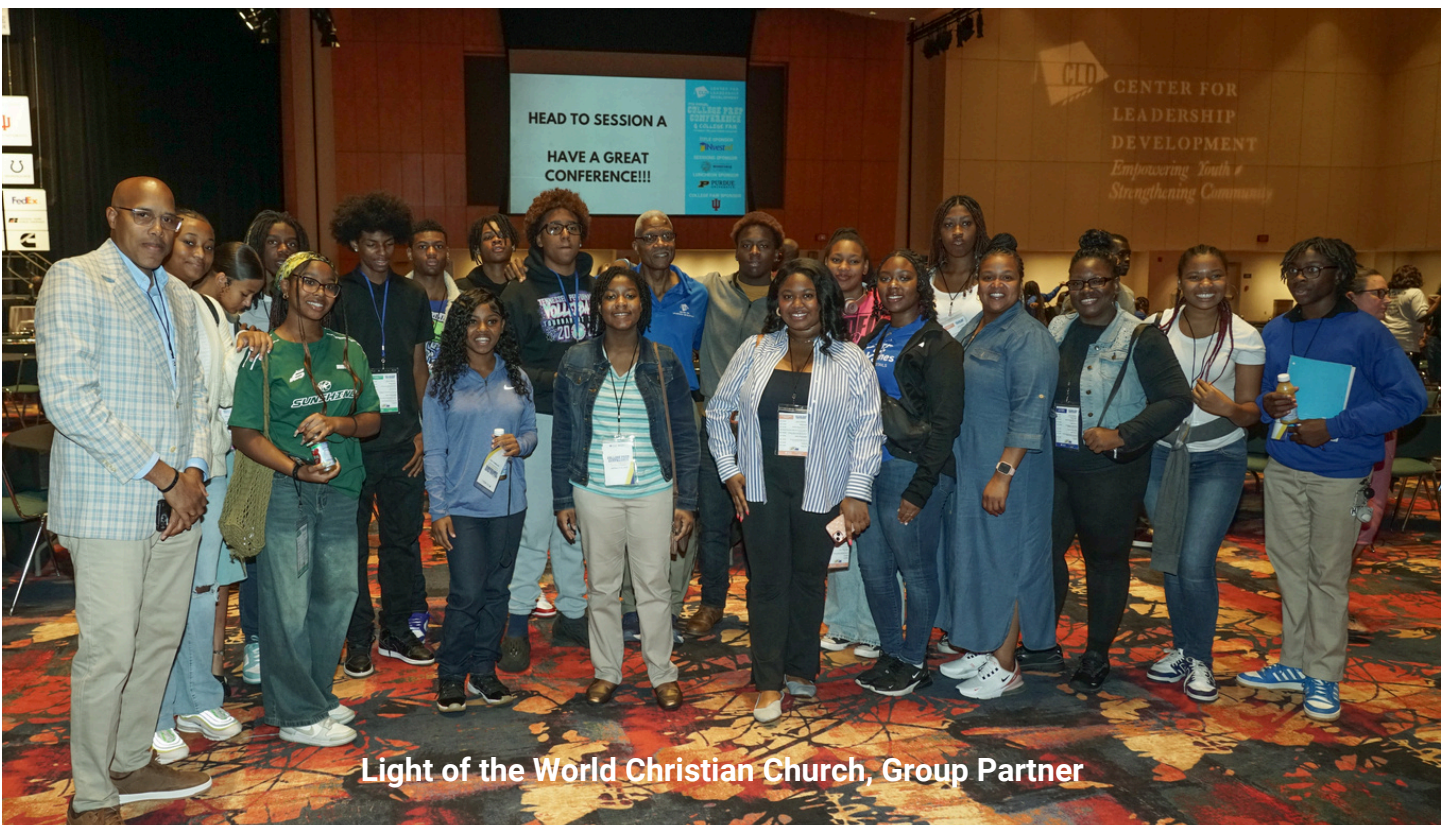
Light of the World Christian Church, Group Partner